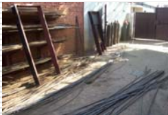
No identification of raw material