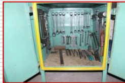
Tool box after