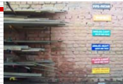
Identification of raw material with color coding