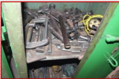
Tool box before